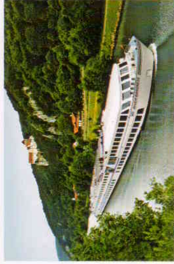
The River Baroness

• Two nights at the superior, first class Le Meridien Montpanasse (or similar) with breakfast daily • All Transfers • Expert Uniworld representative host • Musee d'Orsay visit • Quietvox