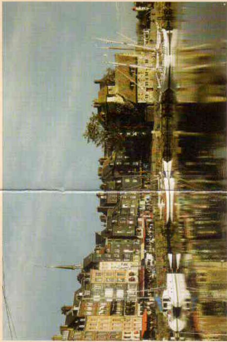
Honfleur Majestic Port